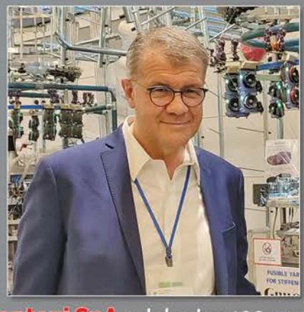
Santoni SpA celebrates 100 years of knitting technology revolution