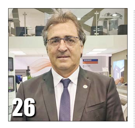
Resounding success for ITALIAN TEXTILE MACHINERY MANUFACTURERS