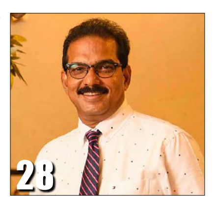
KITEX GARMENTS' plan to emerge No.1 infant apparel producer